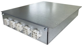
CONNECTION BOX 2 FOYERS I369 B20